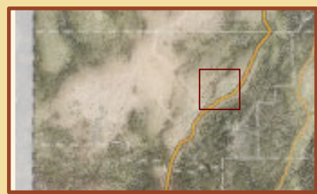
Little Salt Lake