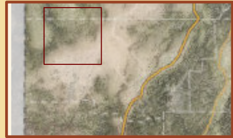
Horse Stud Rice Mountain